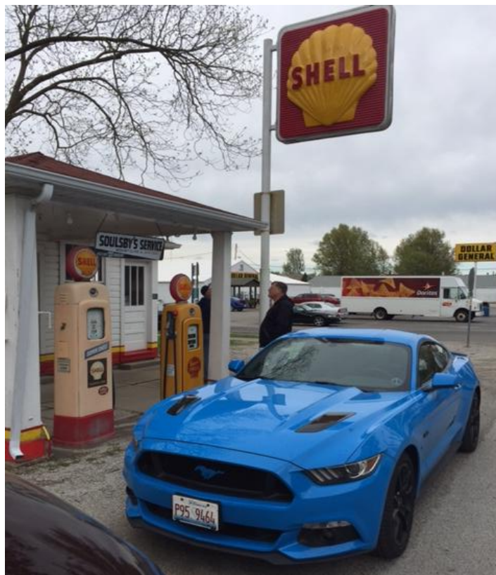
Shell Mt. Olive