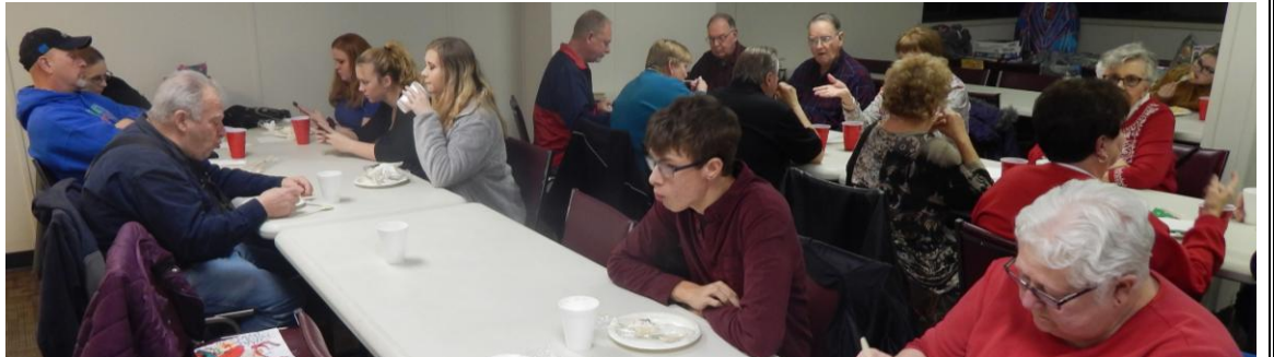
Christmas Party cont.

OWNERSHIP NOT ESSENTIAL.....ENTHUSIASM IS!!!!!!!!!!!!