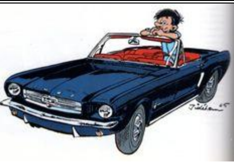
Note from the President