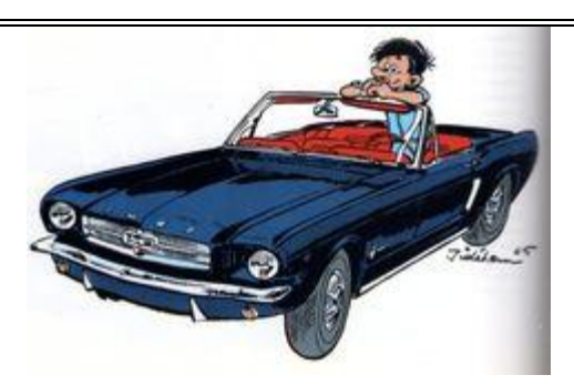
Note from the President

Continue to remember our members and their families with illness, hospital stays, surgeries, and are continuing with treatments, and therapies. Please Pray for their recovery and a healthy New Year.