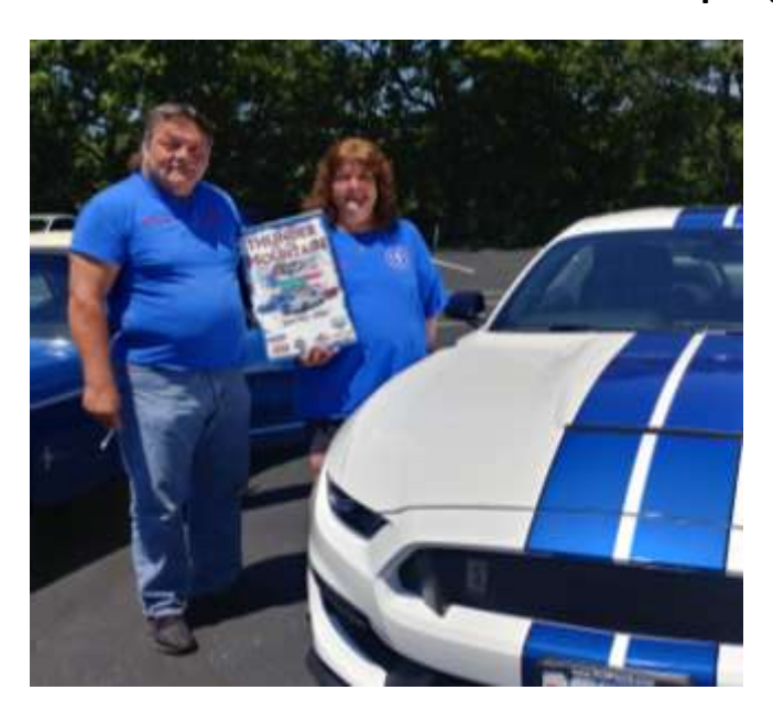
Club members display at premier of F9 at Alton square