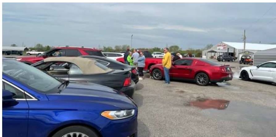
Lunch in Springfield