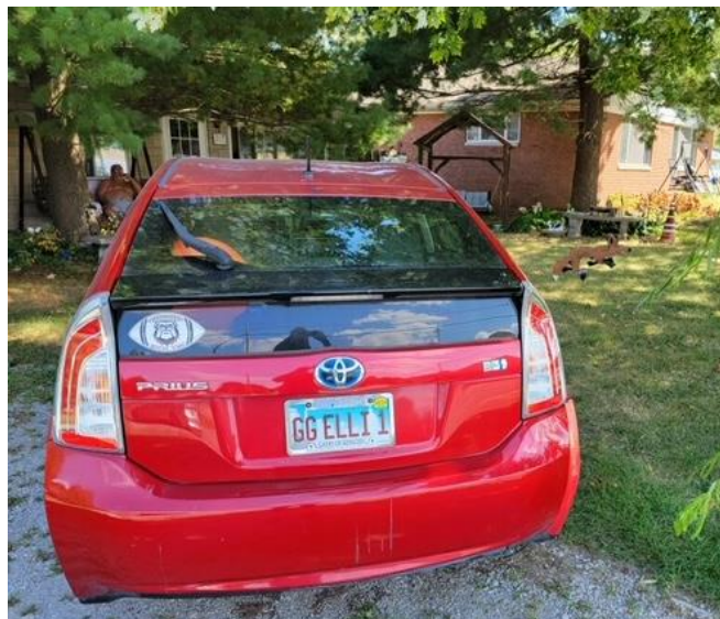
Prius owner with fox body dreams