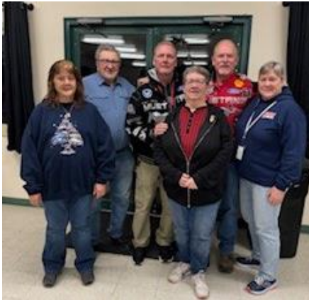
2025 SIMA Officers & Reps

2025 Officers & Award recipients for 2024