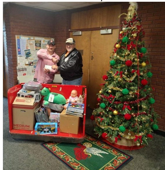
Toy Donation – Salvation Army