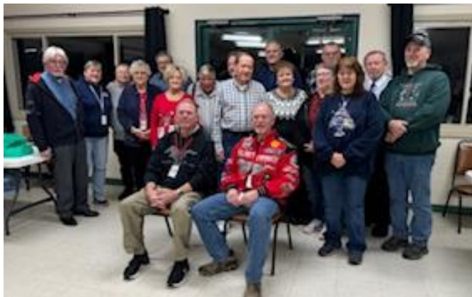
SIMA Club Members 2024 Christmas Party