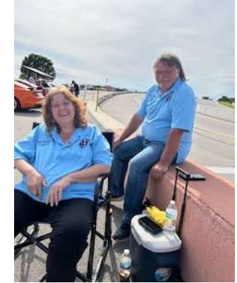
Taking a breather at the track.